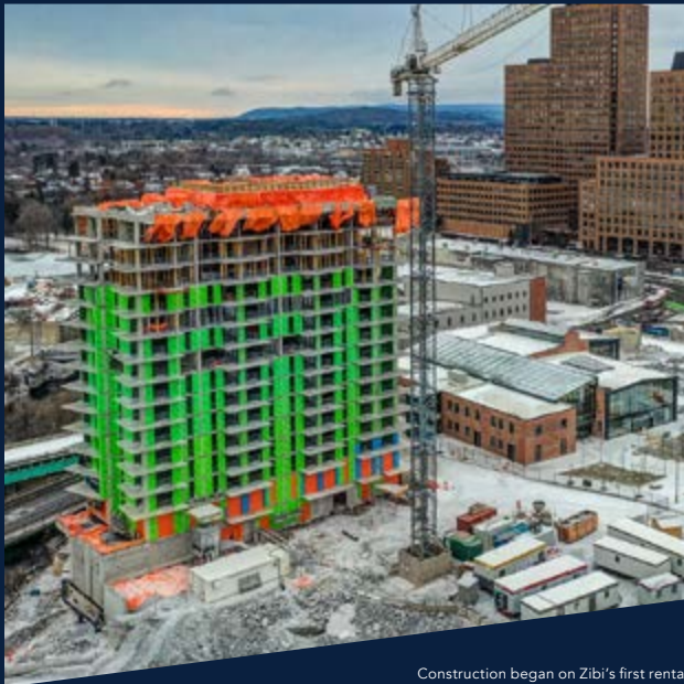
Construction began on Zibi's first rental building at the Eddy and Jos-Montferrand intersection in Gatineau.