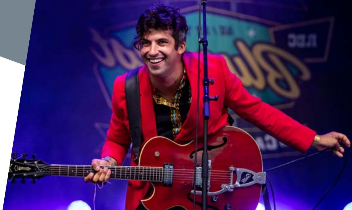
A diverse range of emerging and established Canadian artists and bands such as Sam Roberts Band, Patrick Watson and Tim Hicks during Canada Performs at the RBC Bluesfest Drive-In at Zibi.

In March 2020, almost all work on site came to a complete halt for several weeks due to the COVID-19 pandemic. We pivoted events to host livestreams instead of concerts, outdoor distanced fitness classes and drive-in events to keep our community together during the uncertain times.