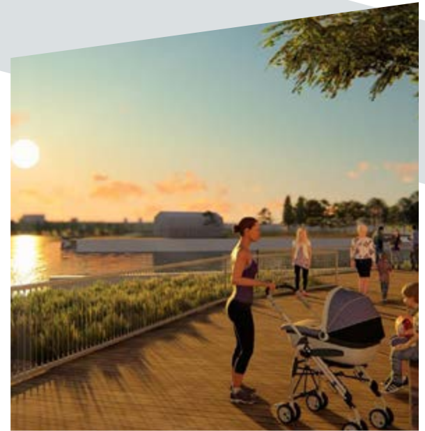
Pangishimo Park, a new 0.3-hectare waterfront destination on the western shoreline of Chaudière East will open to the public.