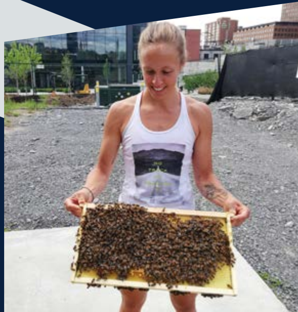
Our third year of urban beekeeping at Zibi.