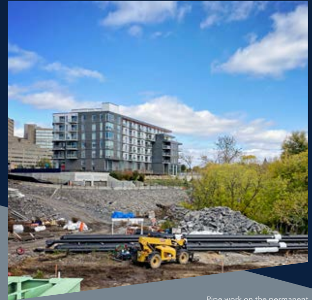
Pipe work on the permanent DES plant in the basement of Block 10.