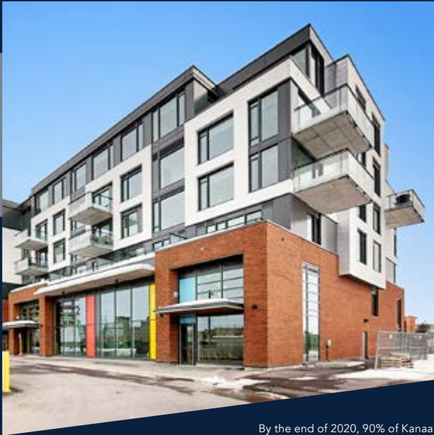
By the end of 2020, 90% of Kanaal Condominiums were sold and occupied.