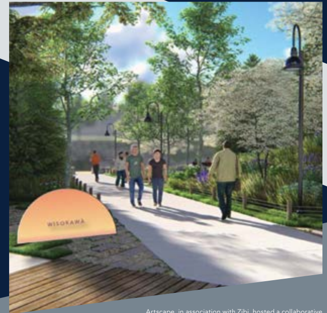
Artscape, in association with Zibi, hosted a collaborative artist residency program to bring artists from the NCR and from the Algonquin Anishinaabe communities of Ontario and Québec into the design and animation of the site, resulting in 3 public art pieces commissioned for Zibi.