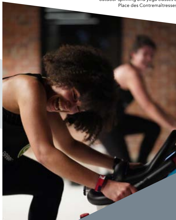
Barres and Wheels kept us fit with outdoor spinning and yoga classes at Place des Contremaîtres.