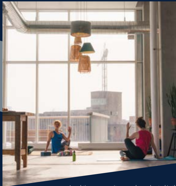
Lunchtime community yoga classes hosted in the first few months of the year, pre pandemic.