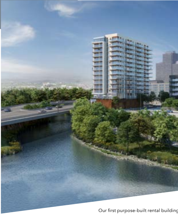
Our first purpose-built rental building will begin occupancy in late 2021 at 10 Jos-Montferrand, Gatineau