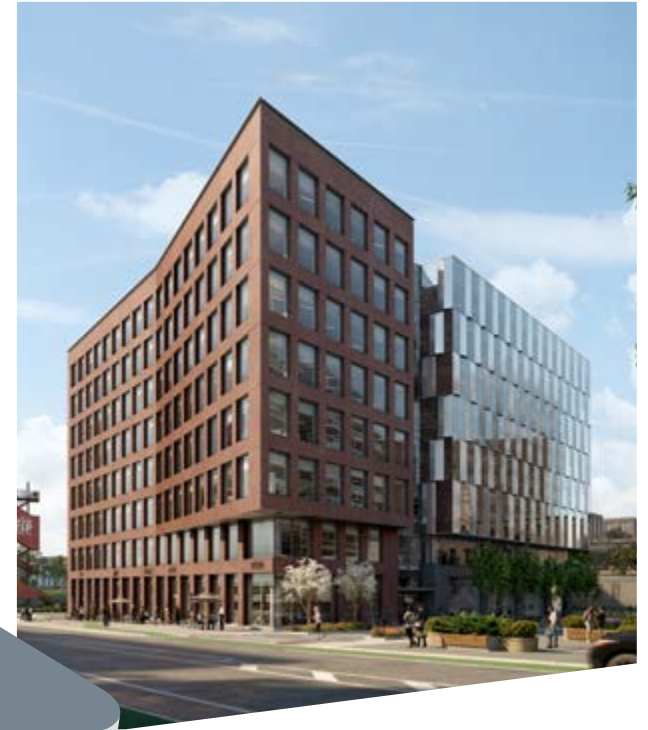
In late 2021, located on Chaudière west and fronting on Booth, this office building will open its doors to federal government workers on the upper floors and street-front retail on the ground floor.